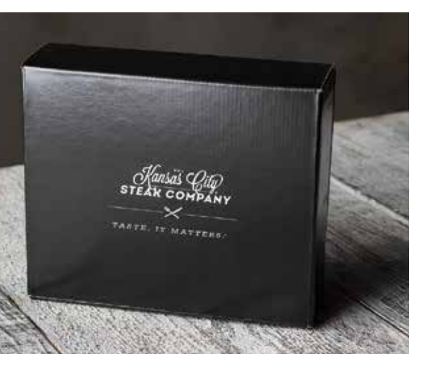
See more gift boxed options at KansasCitySteaks.com/Giftbox